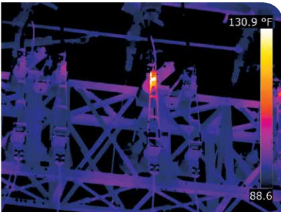
Overheating substation circuit breaker