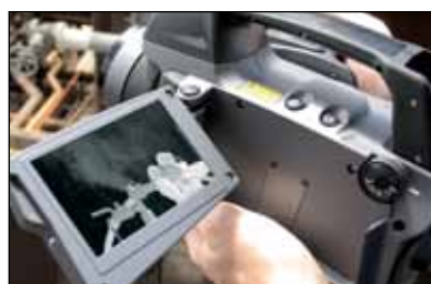
Tiltable, flip-out 4.3" High Contrast Color LCD allows you to view targets more safely from any angle.