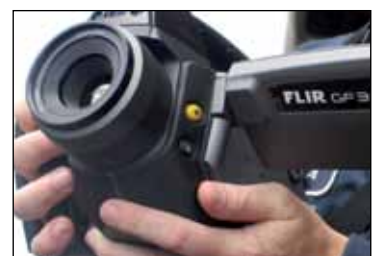
Automatic (one Touch) and Manual Focus with 1-8x continuous digital zoom helps you to deliver the perfect picture at ease.