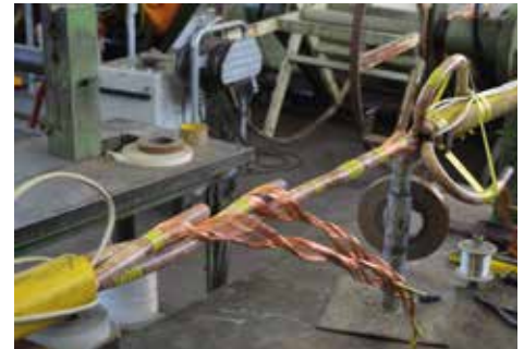
Connecting the enormous tangle of fibers which eventually constitute the whole cable is a meticulous and time-consuming job for specialists.

The FLIR E40bx is a compact point-and-shoot thermal imaging camera that combines the best performance and value in compact thermal imaging cameras. The camera is easy to use out of the box and offers a temperature range of -20 to 120°C (-4 to 248°F) with an accuracy of ±2% and a thermal sensitivity of < 0.045°C. The 160 x 120 pixel resolution provides high thermal image quality and a 3 megapixel digital camera provides fixed picture-in-picture allowing the overlay of thermal and visible images for easy location identification and clearer documentation. A laser pointer aids aiming while a bright LED lamp provides light in dark corners. The FLIR E40bx can