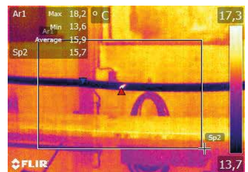
Hot spots in the thermal images clearly show where the fault is located.

For more information about thermal imaging cameras or about this application, please contact: