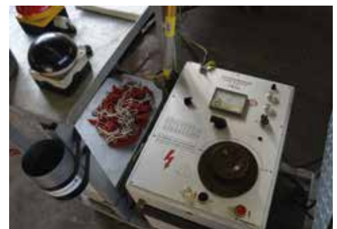
A surge voltage generator is used for locating and pin-pointing high and low resistance faults in power cables