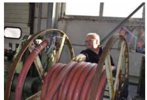
Surges cause noise at the fault position which can be detected either on sight, by feeling the cable with a rubber glove or even by hearing