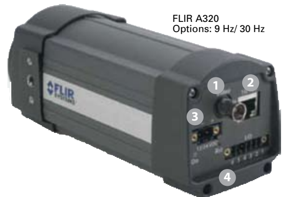
FLIR A320 Options: 9 Hz/ 30 Hz