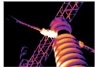
Multiple FLIR A320s can be networked through their 100baseT Ethernet connections, ideal for Power Utility Asset Management.